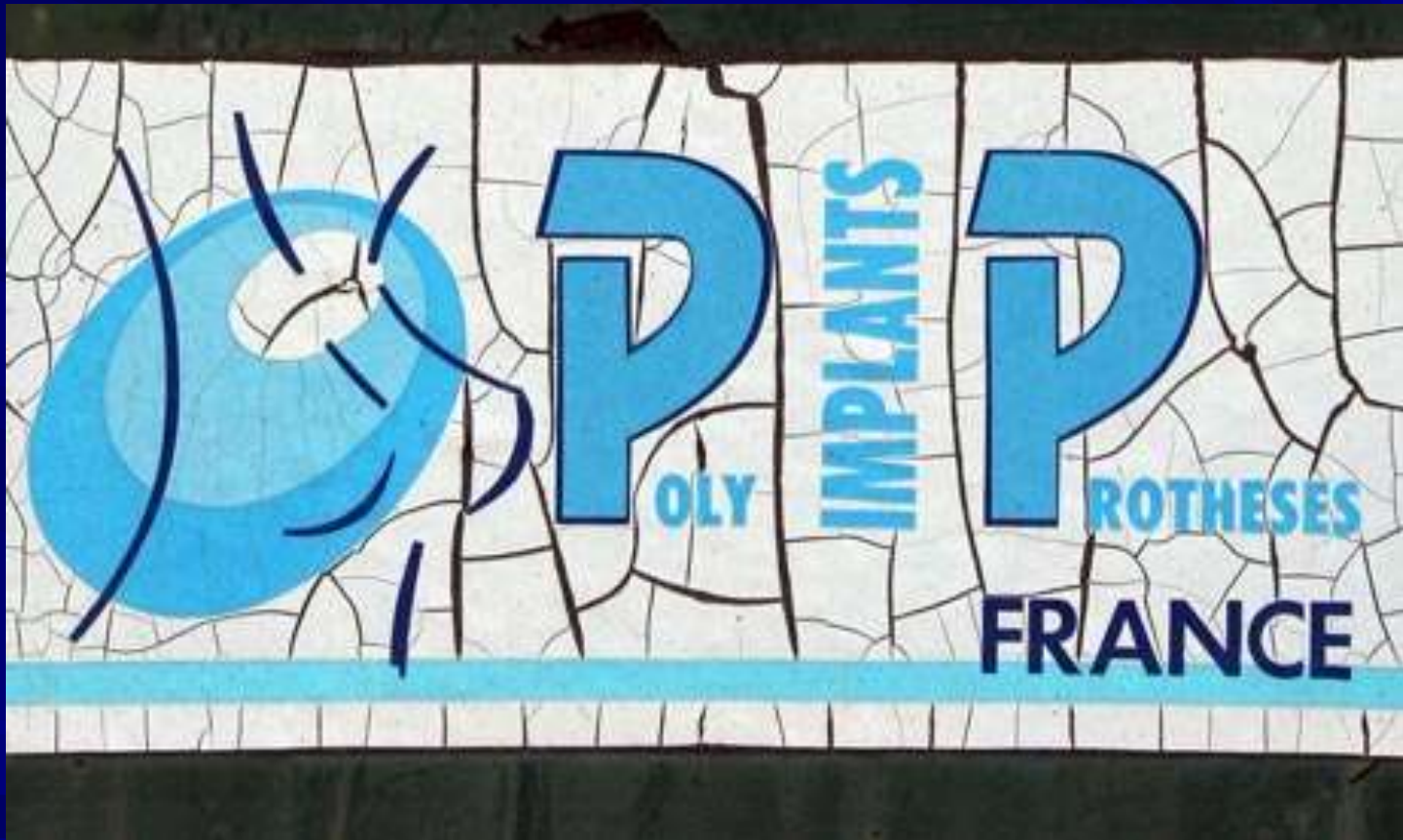
PIP Breast implant